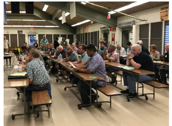
Community Meeting (PEL #1)